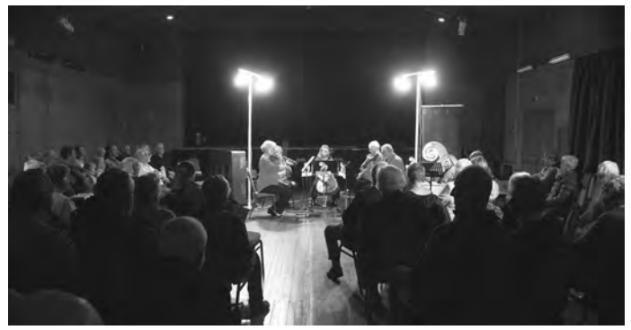
Members of The Central Otago Regional Orchestra perform in the Ranfurly Town Hall.

Of the two pianos (which reside in the supper room of the hall) tested by the concert pianist, one was given the 'all clear' to replace the electric equivalent they'd brought with them – and, boy, did it sound stunning! Many commented that it probably had not been played like that for many years! Artists from the committee also took the opportunity to display their works on the night and those who attended had a wonderful evening and were delighted with the quality of the performances.