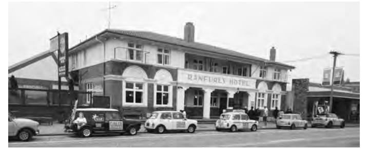
In homage to the beloved Kiwi classic movie 'Goodbye Pork Pie' 60 teams drive their MINIs more than 2,500km from Kaitaia to Invercargill over Easter to raise money for KidsCan. Maureen Weir caught them on camera