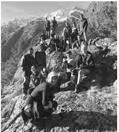
far looking down from whence they came.

A few bleary-eyed trampers arose the following morning with the promise of clear blue skies and far