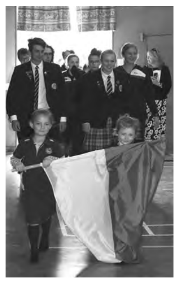
Leading in MAS to Opening Ceremony

The Maniototo community came together collectively support the Area Schools Tournament hosted by Maniototo Area School held mid-May. Schools from Catlins, Waiau, Roxburgh, Twizel, and Lawrence descended on the Maniototo for a full schedule of events. Residents were called upon to assist with hosting billets and the level of support (even from people with junior school students or