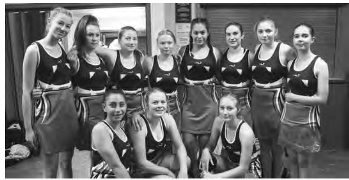
Maniototo Area Schools Girls Tournament team.

Every facility possible was used to give the Year 9 and above students the opportunity to play a wide selection of sports and activities. It was fantastic to see the basketball court in the Maniototo stadium cranking